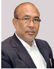
N. Biren Singh

Earlier, yesterday evening, caretaker Chief Minister N. Biren Singh had invited all BJP elected members for a cup of